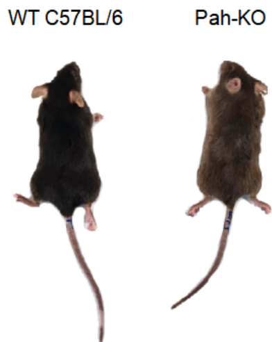
Fig2. Hair coat color in WT C57BL/6 and Pah-KO mice.

(A) The Pah-KO mice showed lower body weights than the WT mice (n=20/group). (B) Summary of blood Phe at various timepoints is shown (n=20/group). (C) Summary of blood Tyr at various timepoints is shown (n=20/group). Note: Data from the third party.