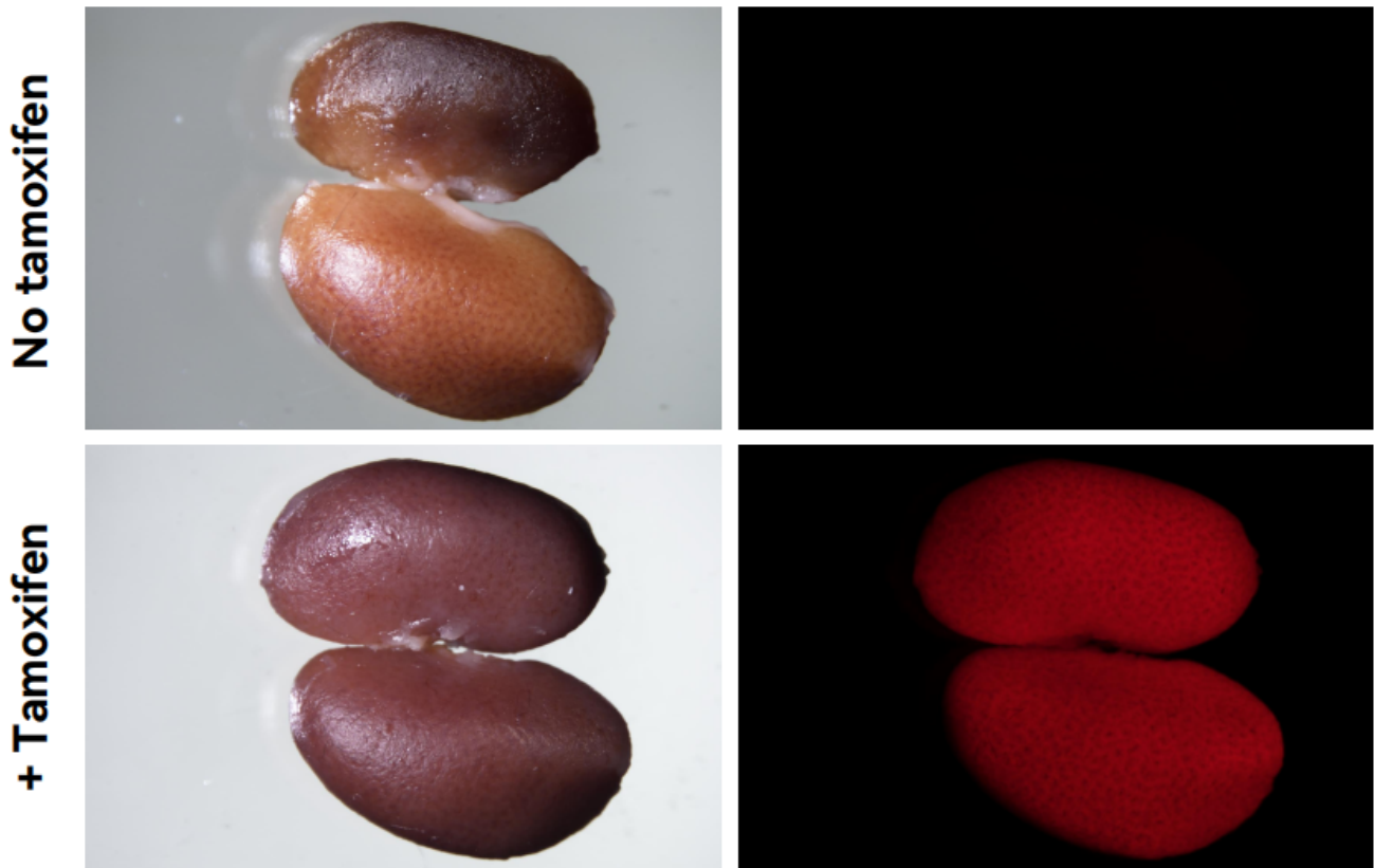
Fig1. CreERT2-mediated recombination in kidney of Slc34a1^{CreERT2/+}; Rosa26^{tdTomato/+} mouse.