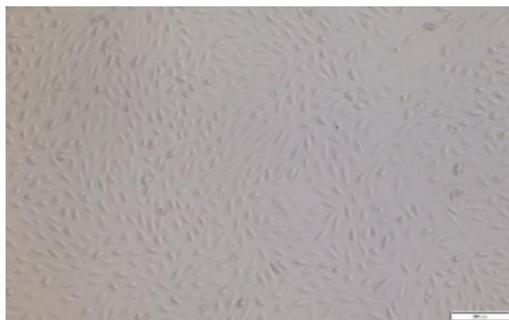
Fig1. Morphology of A-498 cell line.